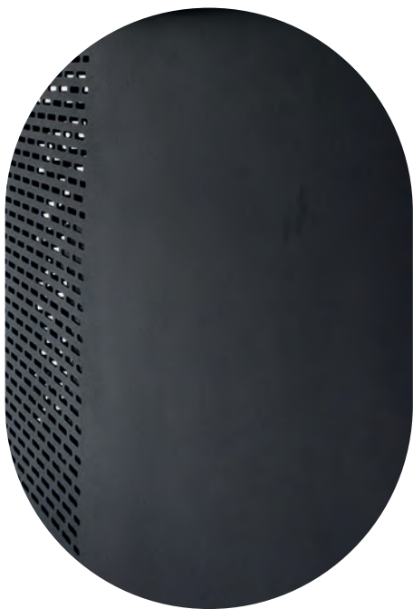
Black Aluminum Surround