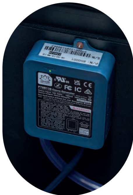
Ozone and Filtration systems